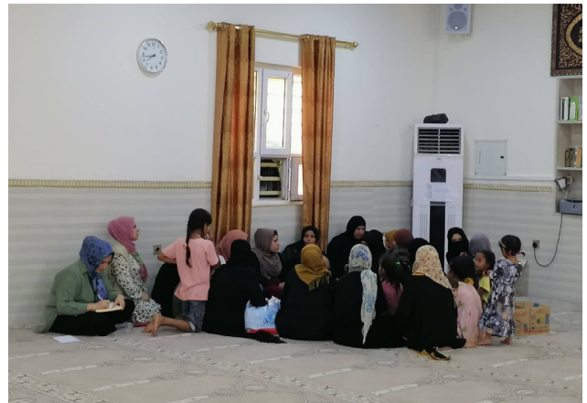
ABC Kirkuk Debris Community Discussion