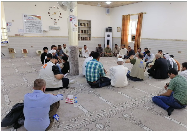
ABC Kirkuk Debris Community Discussion