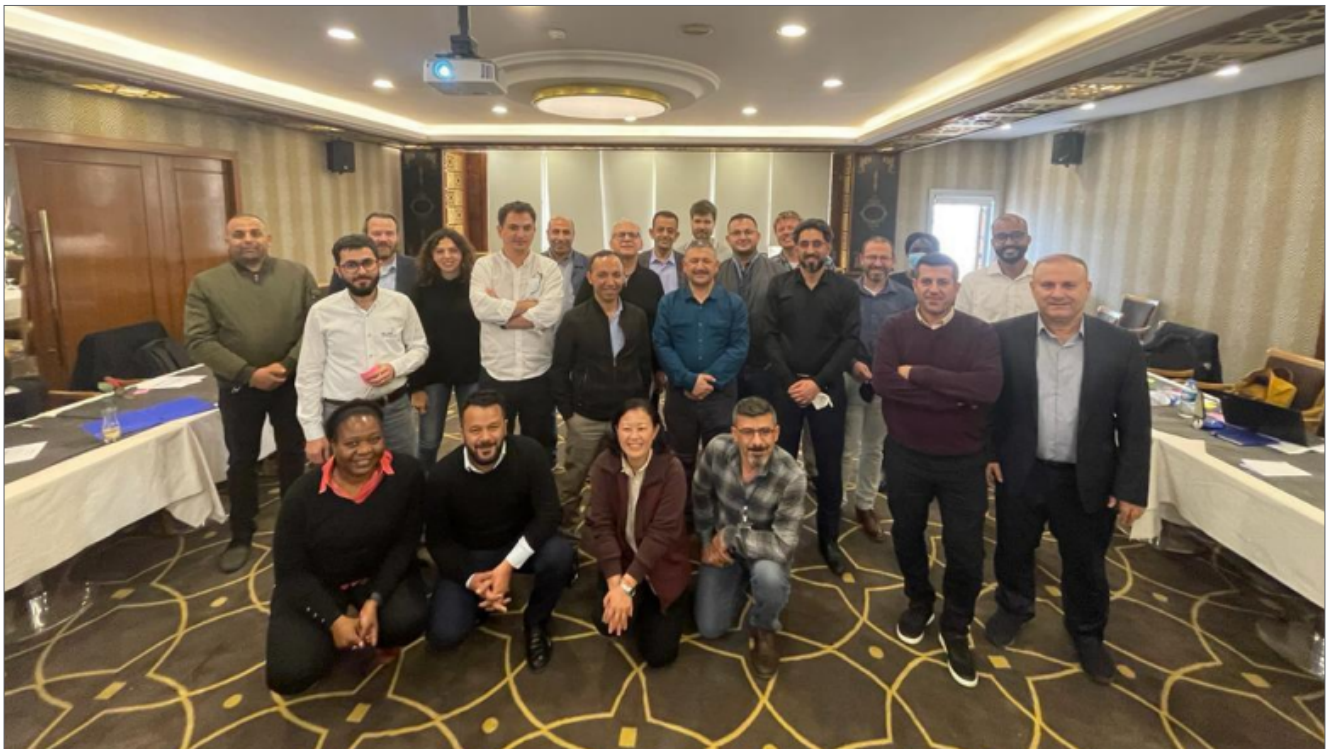
ABC Focal Point/DSTWG Support Retreat (Erbil)