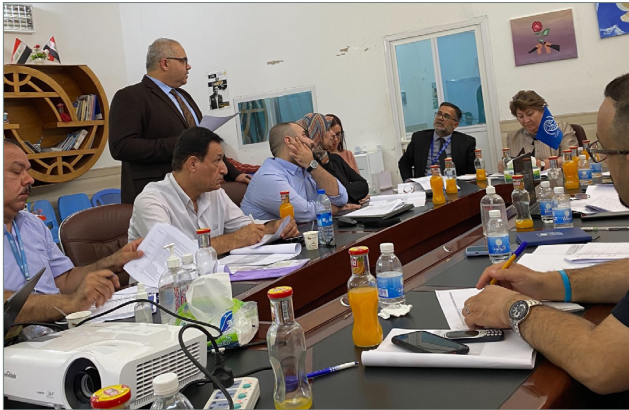
ABC Diyala Meeting with Authorities