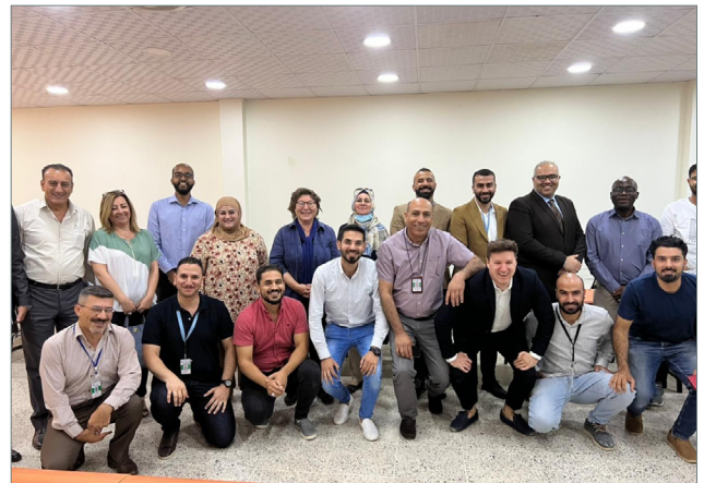
Joint West Anbar/East Anbar ABC Meeting (Ramadi)