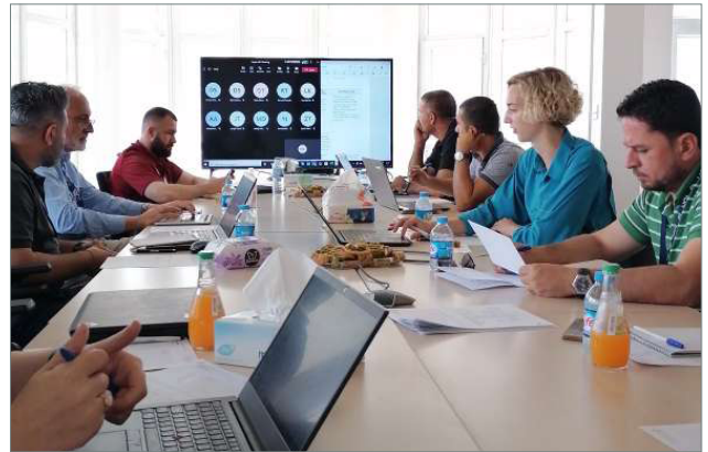
ABC Mosul Meeting